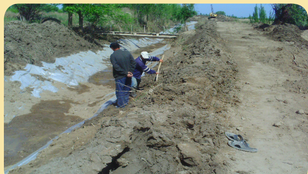
Picture 4. Laying ground