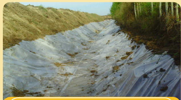
Picture 3. Placing film