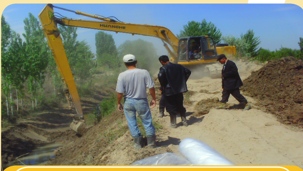
Picture 1. Cleaning of the canal

The data obtained shows that on the “Navruz-Yap” canal, on the section insulated by polyethylene film, the average efficiency was 0.89, while on the