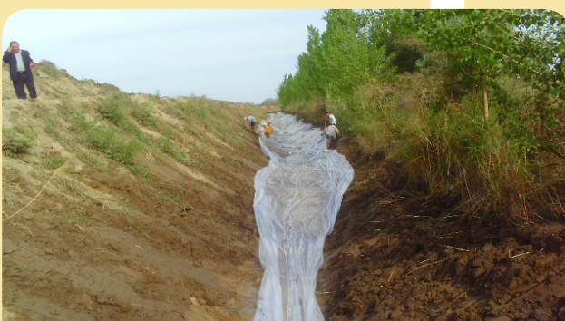
Picture 2. Placing film